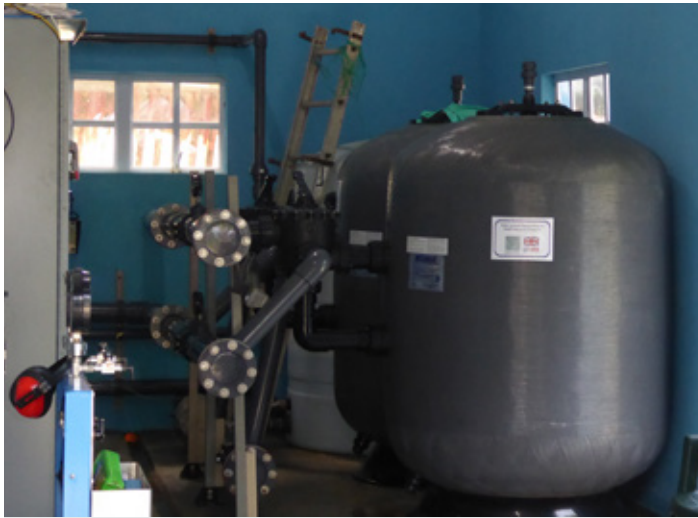
Desalination plant, Seville, Carriacou