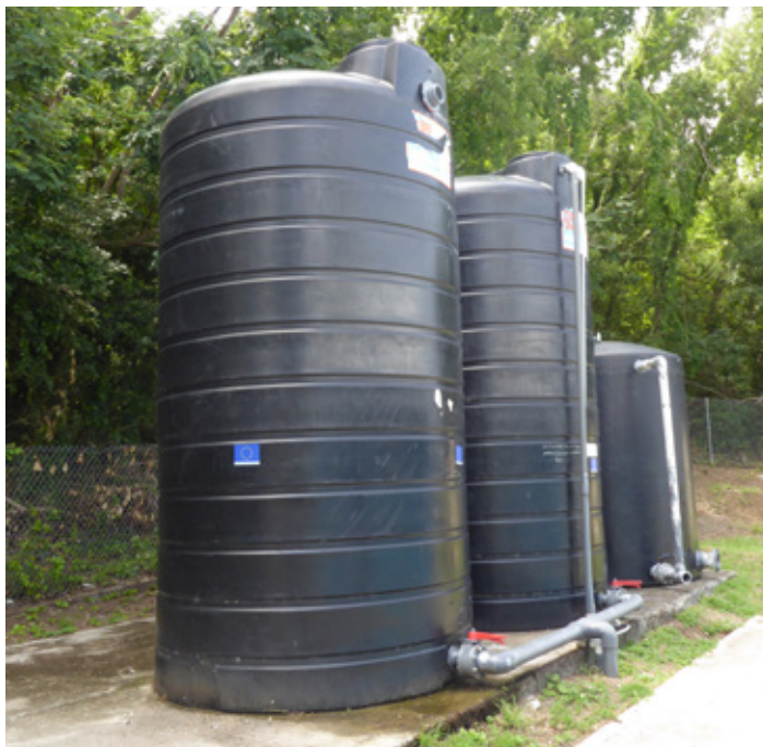
Water storage tanks at the desalination plant, Seville, Carriacou