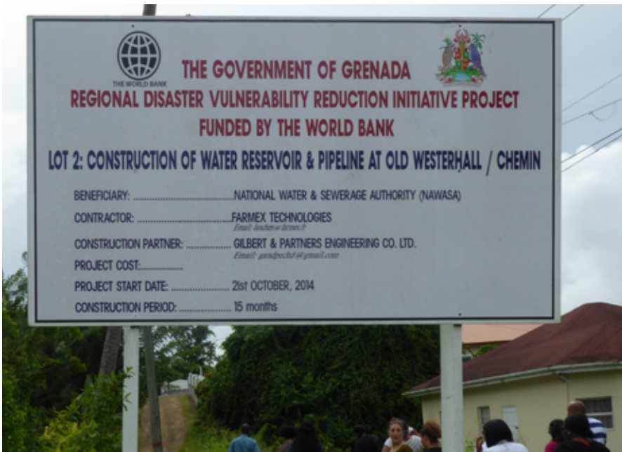
Attendees of the recent PPCR LAC Regional Exchange event in Grenada visit the construction of a reservoir funded by the world bank.