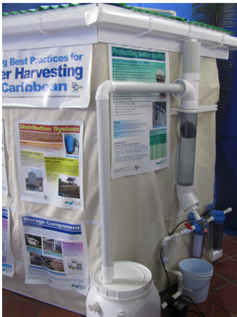
Model of an RWH system

Other partners in the region replicated it and a new model was developed with the technical support of Jamaica's Water Resource Authority (WRA). The Government of Jamaica used the model to help promote the microfinance credit line (a PPCR project) for financing such solutions (see the Microfinance Knowledge Brief in this series for more information).