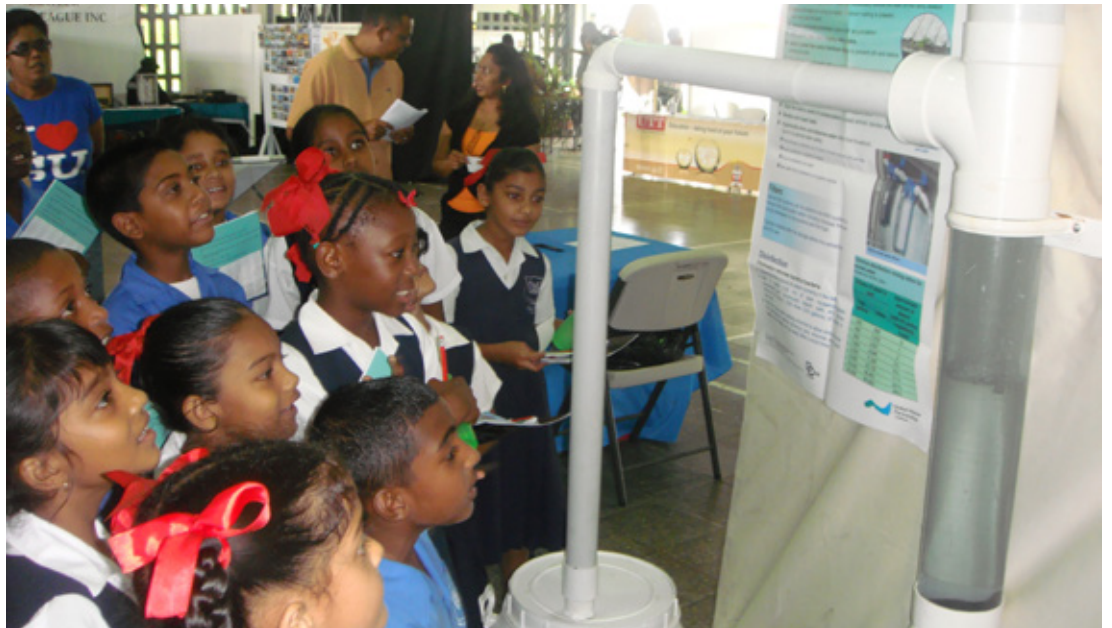
School children from Trinidad and Tobago were fascinated by the RWH model at a local exhibition.

SUCCESSES: DWRM solutions such as RWH, community-level storage, and small-scale desalination present opportunities for resilience building in communities that are some of the most vulnerable to climate change, such as those located in the SIDS.