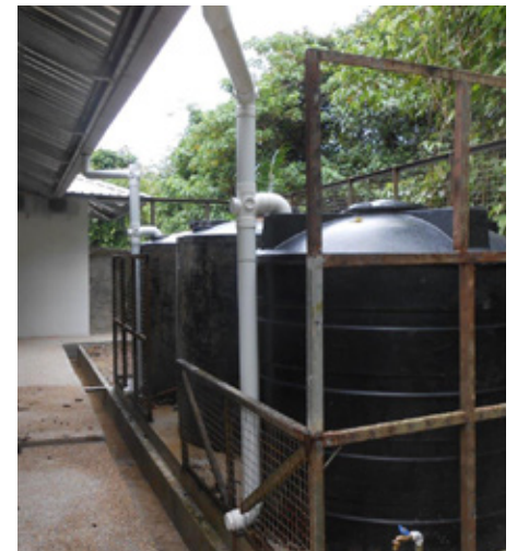
Example of an installed First-Flush Diverters, CARICOM & GWP

The first-flush diverter is a simple, effective solution for improving water quality in RWH systems. The first rain that washes off of a roof (the 'first flush') usually contains unwanted materials from the surface, for example animal droppings, leaves and dust. These materials can all reduce the quality of the stored water, if this first-flush enters the storage tank. A first-flush diverter is a simple installation that is part of the downpipe. It is set up to remove the first water that comes off the roof so that it does not enter the tank. It channels the first flow down the downpipe to its base, where it drains away. Thereafter, the cleaner water settles on top, and relatively clean water enters the tank.