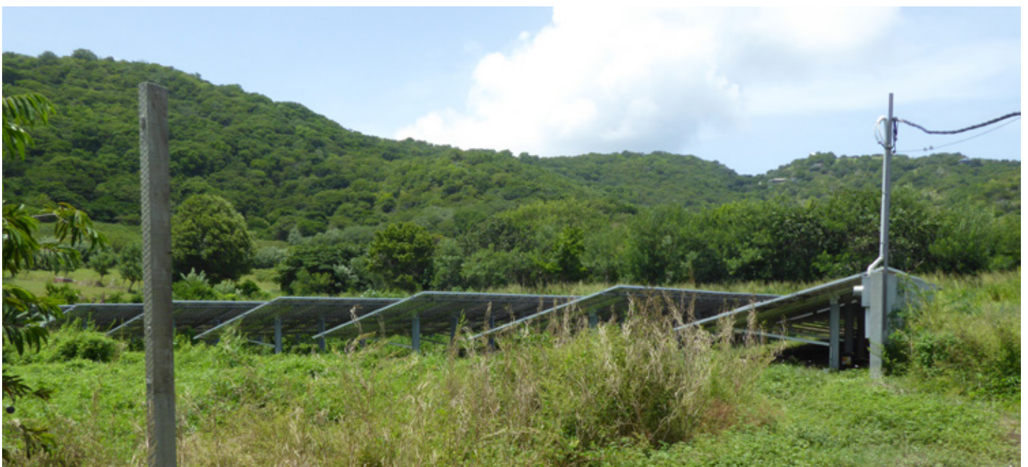
Solar PV powers the desalination plant at Seville, Carriacou.

Storage tanks (left) form part of the desalination process in Seville, Carriacou, powered by the nearby solar PV plant (below).