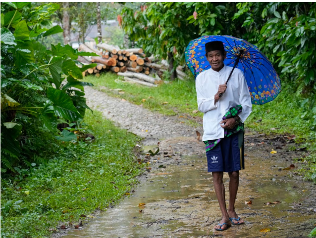
DGM in Indonesia

In DGM, IPs & LCs, as those with the closest connection to the land and biodiversity, fully determine the procurement, selection, and grant funding of the local projects. Multilateral development banks (MDBs) and nongovernmental organizations (NGOs) provide fiduciary safeguards and operational support, while ensuring that decision-making and implementation remain in the hands of IPs and LCs (see Figure 2).