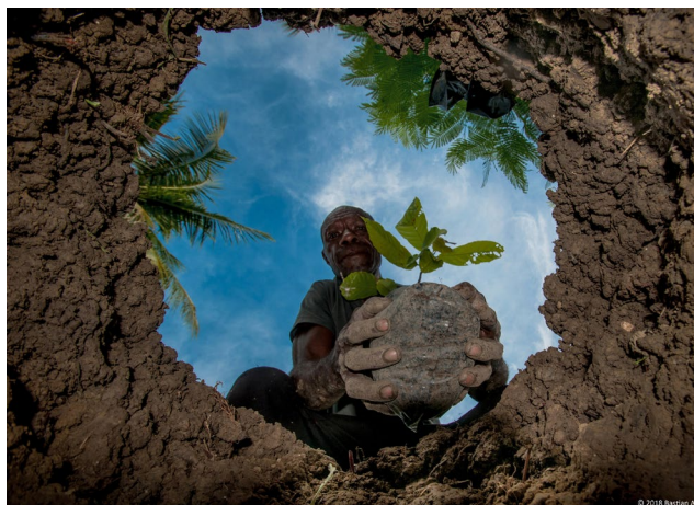
DGM in Papua, Indonesia