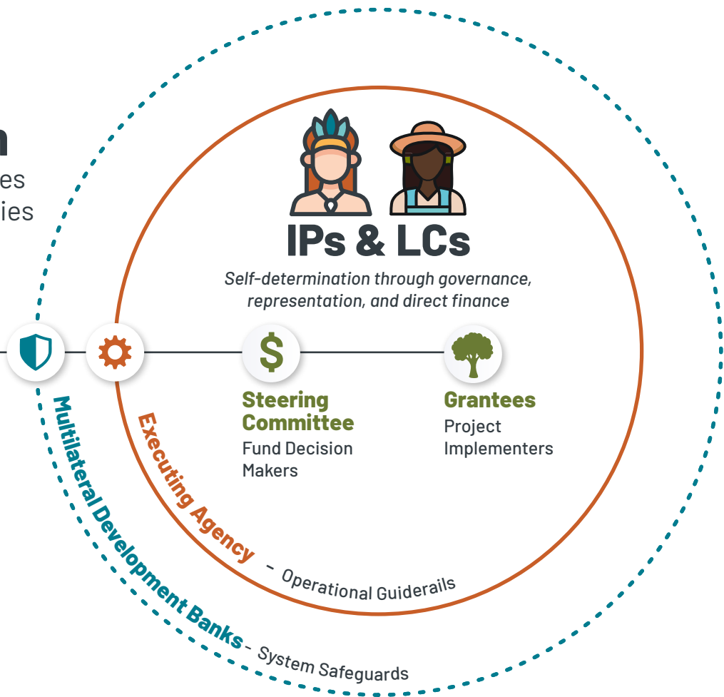
Fig. 2: DGM governance model